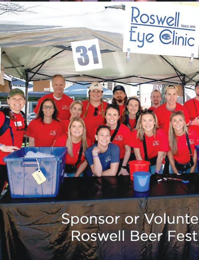
Sponsor or Volunteer at Roswell Beer Festival