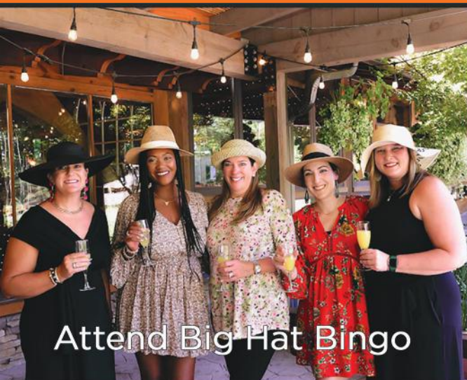
Attend Big Hat Bingo

STAR House Foundation is a non-profit organization that provides educational and enrichment programs to at-risk elementary students 100% free of charge. Generous support from civic groups, businesses, and faith communities help us provide the unique, specialized approach to youth intervention that makes our programs so successful. Every child deserves the opportunity to succeed in school and in life. Your gift of time, talent and treasure allows us to offer impactful opportunities to at-risk children in North Fulton and strengthens our community as a whole.