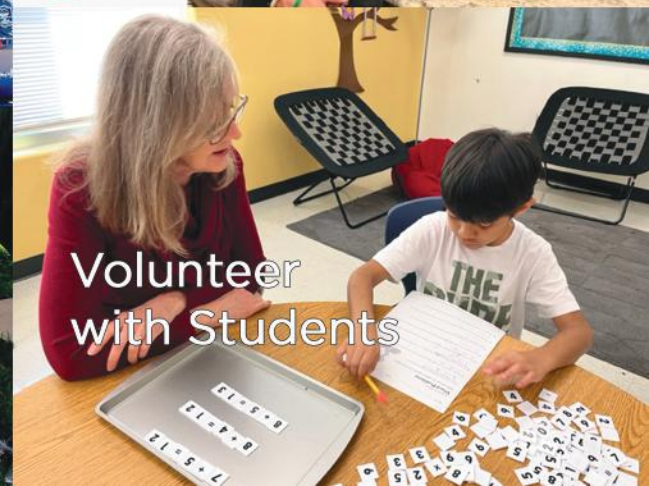
Volunteer with Students