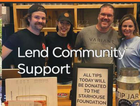
Lend Community Support