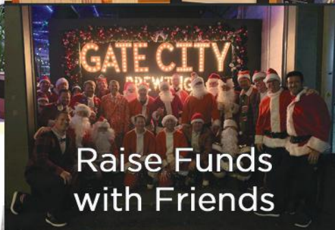
Raise Funds with Friends